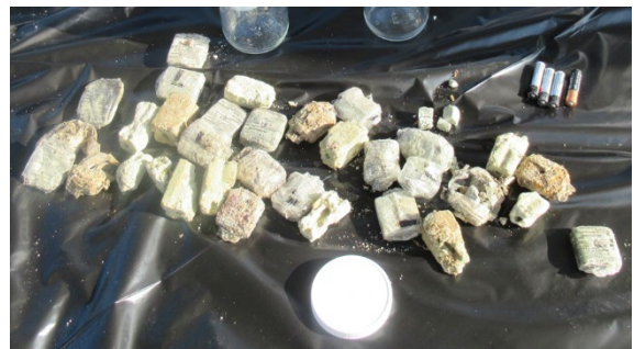
Selontra Rodent Bait in trash at Clark Pest Control in Newbury Park.