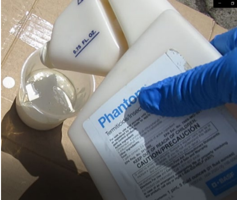
Phantom Termiticide/Insecticide in trash bin at Orkin Camarillo.