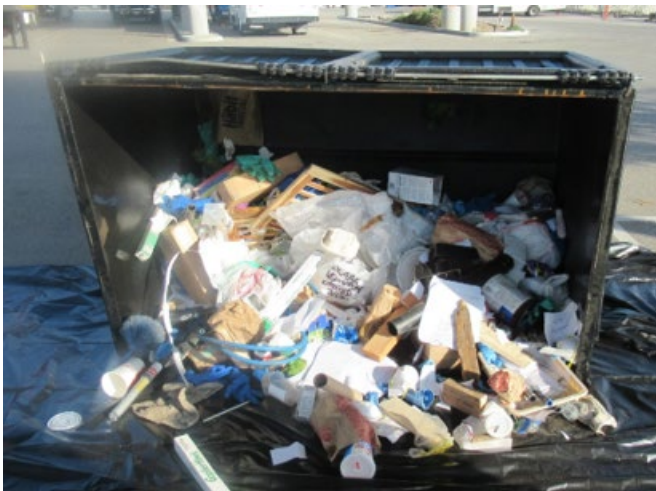
Waste Audit at Clark Pest Control in Newbury Park.

The Ventura County District Attorney's Office joined the District Attorneys of San Mateo, Contra Costa, Alameda, Santa Clara, San Joaquin, Solano, Sonoma, Yolo, Orange, Riverside, and San Diego counties in this enforcement action.