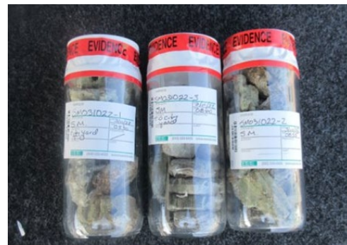
TOP: Collected samples of Termidor & Patrol Insecticide from Orkin in Camarillo.