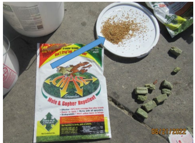
Chase Mole & Gopher Repellent at Orkin in Camarillo.