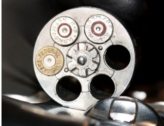
The photograph on the left depicts Padilla's revolver. The photograph on the right shows the three spent cartridges located inside the revolver's cylinder.

Officers also located bullet strikes to Officer Maupin's and Officer Stradling's patrol vehicles. An impact appeared on the front bumper of Officer Maupin's vehicle and bullet fragments were lying in the street near the impact site.