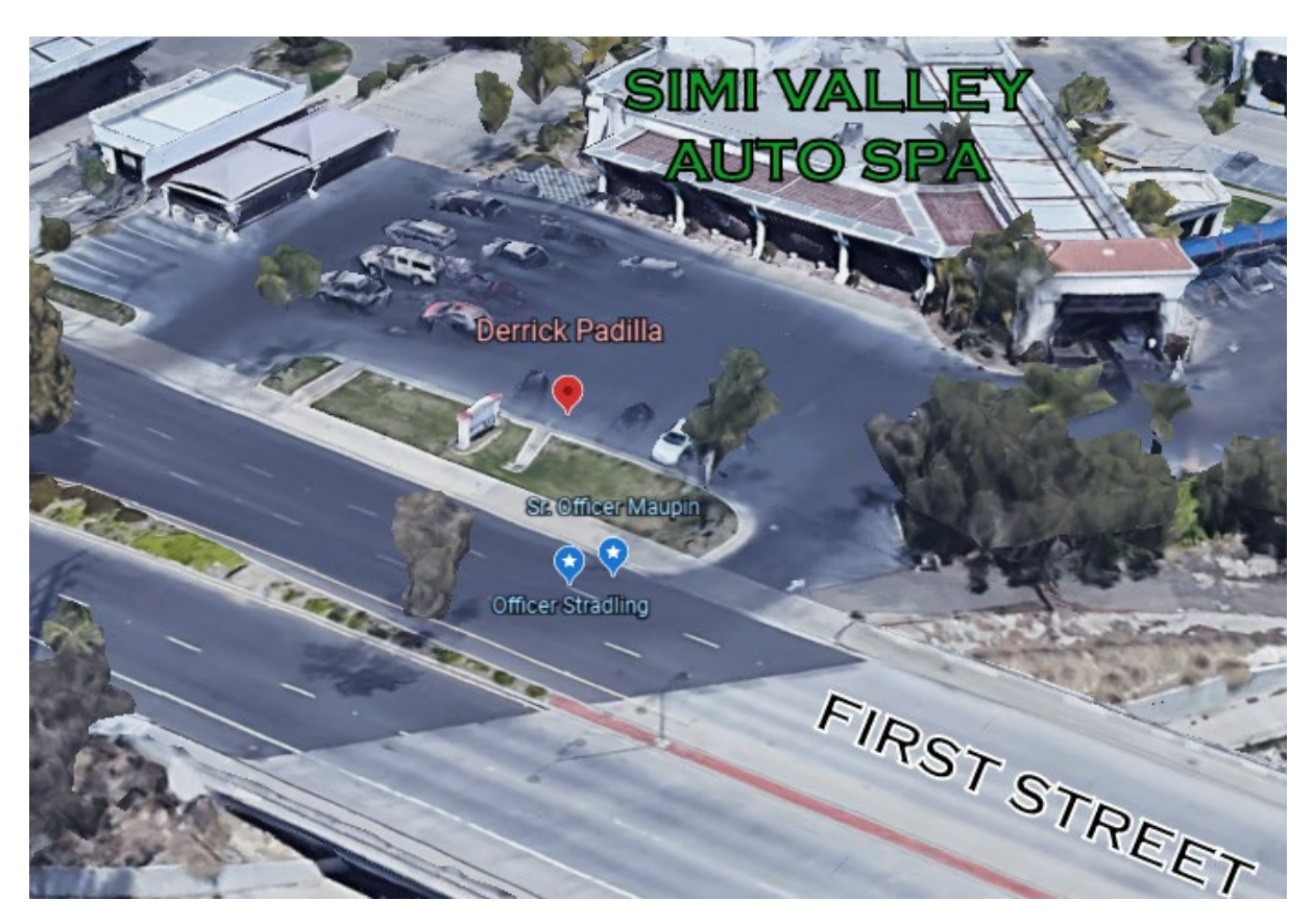
Aerial map depicting the locations of Officer Stradling's vehicle, Officer Maupin's vehicle, and the location at which Padilla's body was located when the scene was processed.

The shooting scene consisted of the parking lot on the west side of 1144 E. Los Angeles Avenue, the east sidewalk of First Street and the number two and three lanes of northbound First Street. The parking lot is part of the Simi Auto Spa and Speed Wash. Between the east sidewalk and the parking lot was a grass embankment. Vehicle 23, Officer Maupin's vehicle, was parked at a slight angle in the number three lane, partially blocking the south driveway of the parking lot. Vehicle 39, Officer Stradling's vehicle, was parked at an angle in the number two lane. Both vehicles had their driver doors open. Padilla's body was located approximately halfway down the parking lot and approximately 10 yards from the curb of the grass embankment.