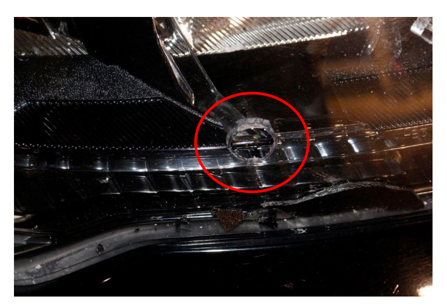
Image of the right front headlight of Officer Stradling's vehicle. The red circle marks the bullet hole.

Officers located a bullet hole in the front right headlight of Officer Stradling's vehicle. The bullet penetrated through the headlight and traveled into the engine compartment. Officers found bullet fragments inside the engine compartment.