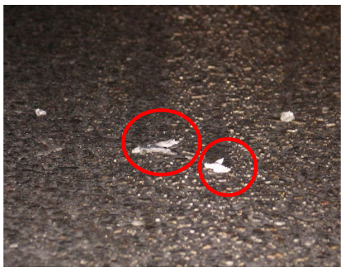
The image on the left depicts the front bumper of Officer Maupin's patrol vehicle. The image on the right depicts bullet fragments located on the ground just below the bullet strike.