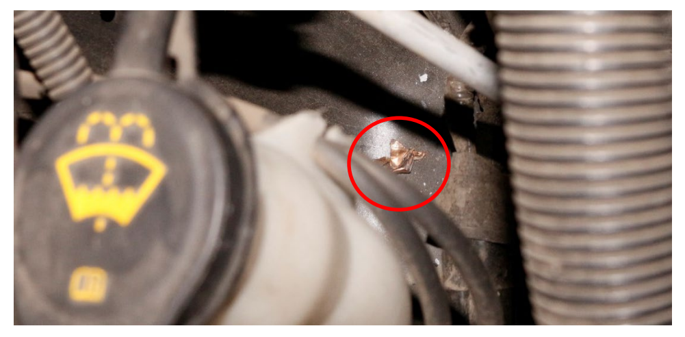
Image of the engine compartment of Officer Stradling's patrol vehicle. The red circle marks a bullet fragment.

Additional items located at the scene included five expended 9mm cartridge cases and six .223 Remington expended cartridge cases. Five divots on the grass embankment were marked and searched. Bullets were recovered from four of the divots. The fifth divot had the same appearance and a similar trajectory path to the other four divots, but no bullet was located.