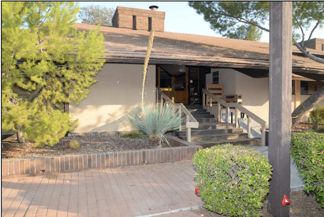
Borderline front stairway and front entrance during daylight hours (the right side door was open during the incident).