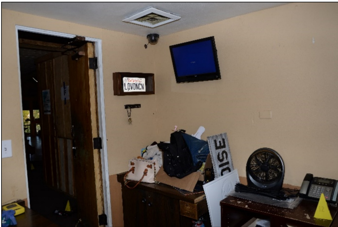
Video monitor and surveillance camera on east wall of the front office.

The office contained a video monitor mounted on the east wall that displayed live feeds for the Borderline's nine video cameras which are described more fully below.