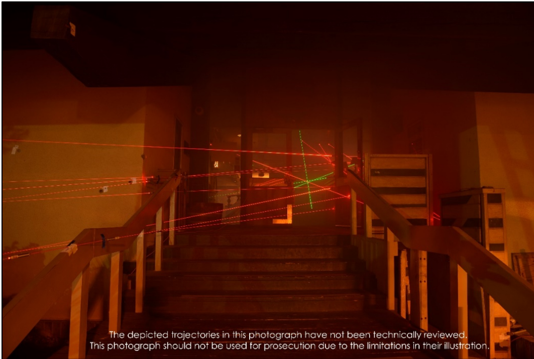
Lasers being used to illustrate bullet trajectories at the front stairway.

The interior crime scene relevant to the officer-involved shooting incident encompassed the front entryway, the cashier counter, and the front office. Other than the surveillance video, there was no direct physical evidence indicating the exact location of any of the participants during the gun battle. Within the area, 24 expended .45 caliber casings were located but it is impossible to determine how many of those were fired when Long shot at Sergeant Helus and Officer Barrett.