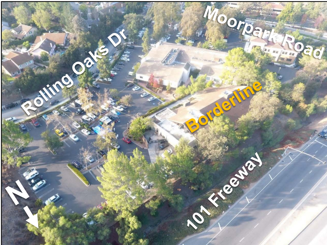
Aerial view of the Borderline.

At approximately 11:18 p.m., Ian David Long entered the Borderline and opened fire. Within a few seconds, he shot several employees and patrons. Most of the remaining patrons fled for their lives but several hid in various places inside the Borderline. Long ignited and threw smoke grenades which filled the Borderline with thick smoke.