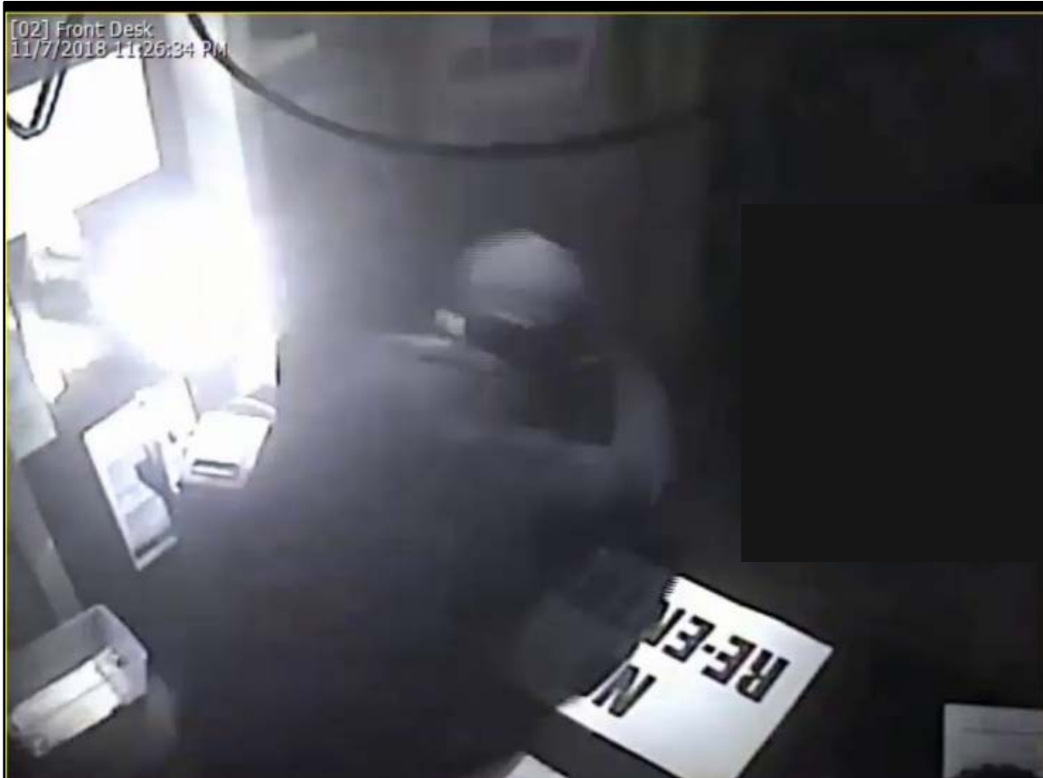
Long firing out the front doorway at the officers from the front counter.

crawled out the door and as he reached the stairwell attempted to stand. Long began firing from the office doorway then ran to the front counter, leaned over it, and fired at the officers through the front doorway.